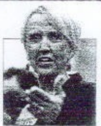
Brewer: Fat taxed

Tubby tax: Arizona Gov. Jan Brewer has proposed charging obese Medicaid patients a $50-a-year fee, to raise money to restore coverage for organ transplants for desperately ill poor people. Brewer cut transplant coverage last year, producing a wave of negative publicity as 98 Medicaid recipients were denied lifesaving kidney transplants and other operations. So, to raise $500 million, Brewer wants to levy a fee on obese Medicaid patients who fail to follow a doctor-prescribed weight-loss plan, as well as on patients who continue to smoke and diabetics who fail to get their condition under control. Critics have dubbed the new proposal a "fat tax."